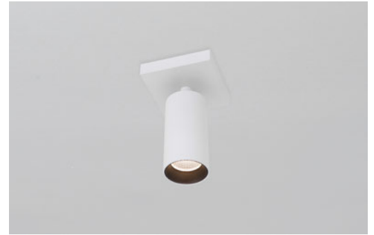
SURFACE Mini S